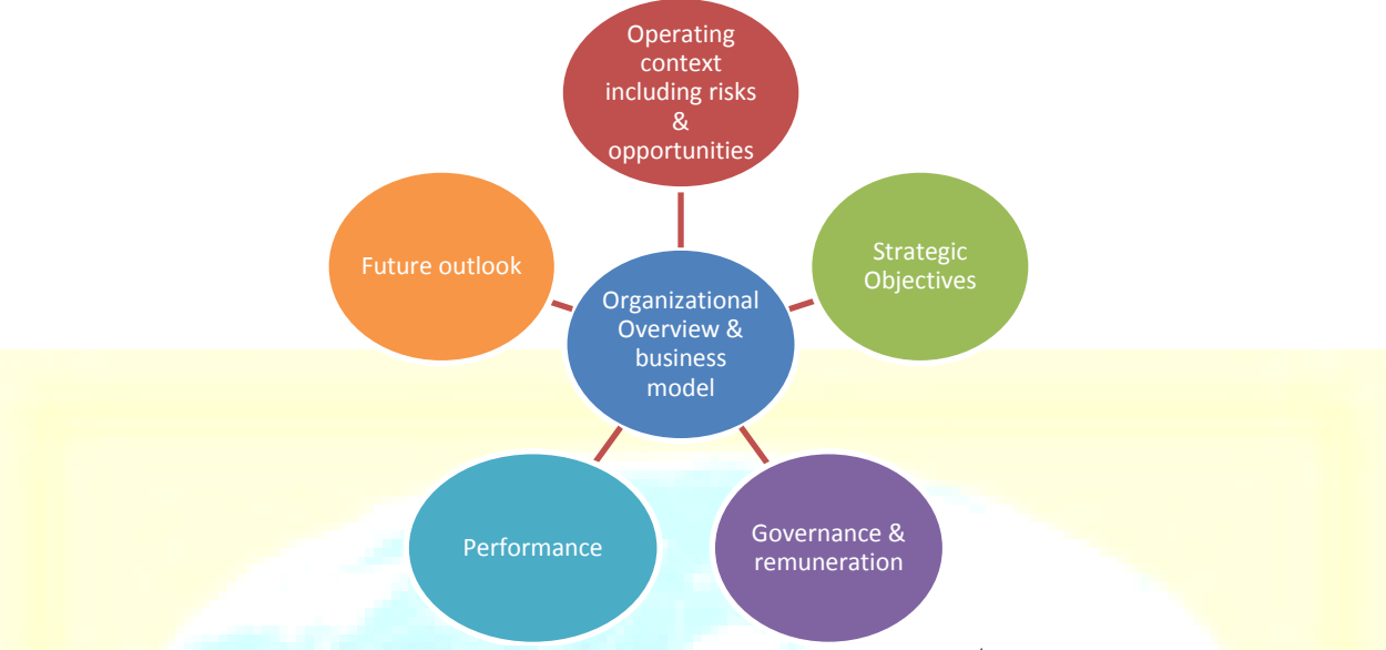
Figure 1:The Principles underlying in the preparation of Integrated Reporting